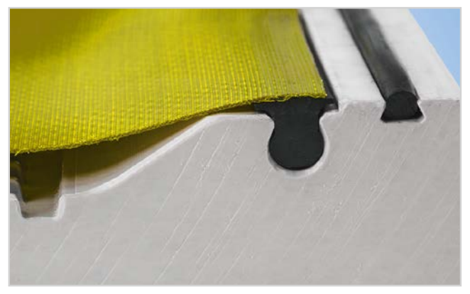
Detailed view of the patented \Omega\text{-groove}