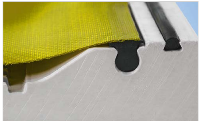
Detailed view of the patented \Omega -groove